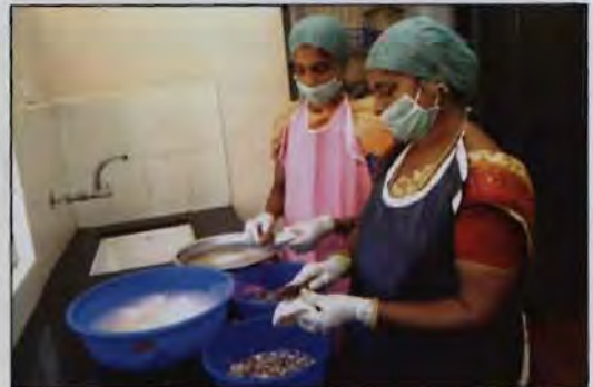
Fig. 5. Manual removal of testa

The testa of the coconut kernel has to be removed for getting good appearance of the end product i.e. Coconut chips. For the purpose, a peeler can be used and the testa can be removed manually (Fig. 5). Care should be taken to peel the testa only, without affecting the white kernel.