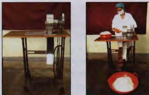
Fig. 8. Mechanical slicing of coconut kernel