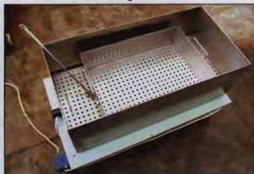
Fig. 9. Blanching unit for blanching of coconut slices

Thoroughly washed coconut slices are put in the muslin cloth and dipped in hot water at 90-95°C for 2 minutes. This facilitates the removal of some amount of oil and milk so that the final product will have more crispiness and taste. A blanching unit developed at CPCRI, Kasaragod for the blanching of coconut kernel is shown in Figure 9.