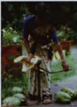
Fig. 3. Dehusking of coconut