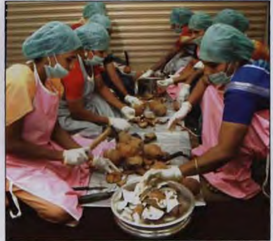
Fig. 4. Deshelling of coconut

scooping out the kernel pieces by knife (Fig. 4). But it will increase the time required for removing the testa.