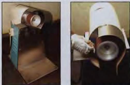
Fig. 6. Testa removal using testa remover

The testa can also be removed using a testa remover machine developed at CPCRI, Kasaragod. The testa remover machine is shown in Figure 6.