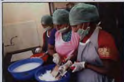
Fig. 7. Manual slicing of coconut kernel

The slicer generally used to slice potato may be used for slicing the coconut. The thickness of the slice should be very thin and should not exceed 0.75 mm. Slicing should be done in such a way that the slices should fall directly in the tray half filled with water. This is to avoid the contamination of sugar syrup. The manual slicing and mechanical slicing are shown in figures 7 and 8, respectively.