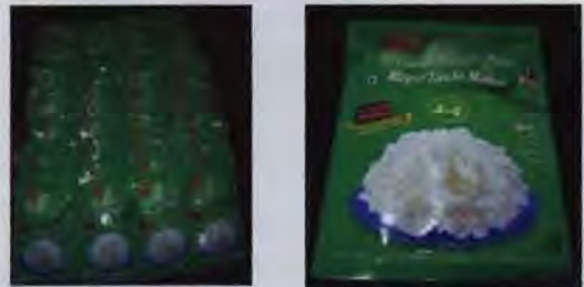
Fig. 11. Coconut chips packed in attractive packing

The sweet coconut chips is hygroscopic in nature. If the relative humidity in the atmosphere is more than 75 per cent, it will absorb moisture and lose its crispness. Hence the chips must be packed in the metallised poly film or aluminum foil laminated with LDPE film pouches, which will maintain its flavor and crispness upto six months without affecting its microbial and biochemical qualities (Fig. 11). To avoid the breakage of the chips during transportation, it may be packed as pillow packet using gases like nitrogen or carbon dioxide.