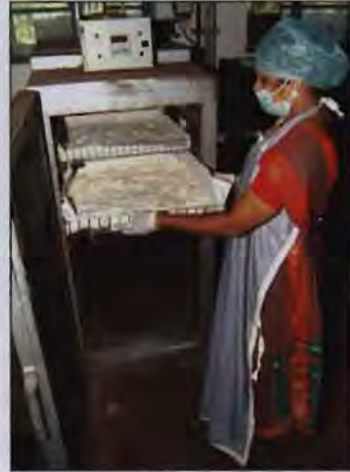
Fig. 10. Drying of coconut slices

Drying cost would be the cheapest in this dryer. However, one operator is required to feed fuel to the chula .