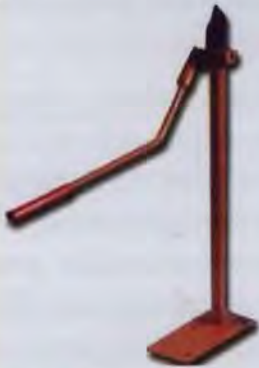
Fig. 2. Coconut dehusker

After the harvest, the coconuts have to be dehusked using a tool called coconut dehusker (Fig. 2) and store the coconut without husk in shade place for 3-4 days. This will help to remove the shell easily. The dehusking process is shown in Figure 3.